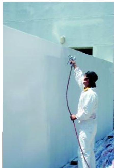
DP Airless painting